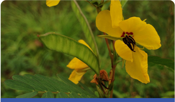
PARTRIDGE PEA (CHAMAECRISTA FASCICULATA)

The soil needs to be prepared into a firm, fine-textured seedbed and should be relatively free of debris before planting. The site can be tilled shallowly with a disc to achieve this. If the soil is still full of clumps, it can be dragged with a harrow or drag to break it up more finely. On smaller areas, tilling with a roto-tiller and then raking with a garden rake works well. If the soil is very soft, to the point where your foot presses down half an inch or more, the soil is too loose. Any seed spread here may be buried too deep to properly germinate. The soil should be packed down with a roller or culti-packer prior to seeding.