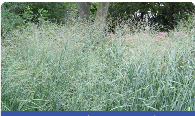
SWITCHGRASS (PANICUM VIRGATUM)