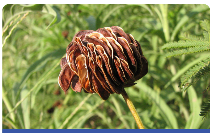
ILLINOIS BUNDLE FLOWER (DESMANTHUS ILLINOENSIS)