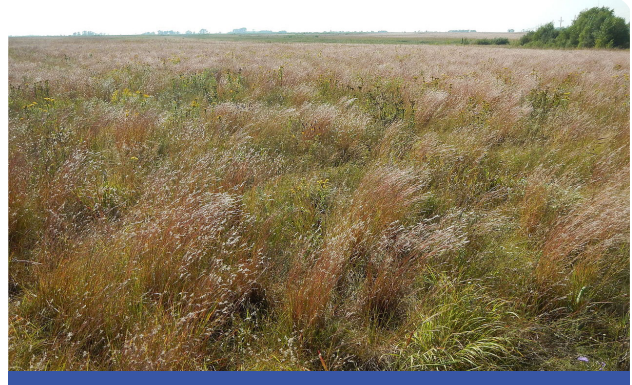
BIG BLUESTEM (ADROPOGON GERARDII)

Native plants take less time and money to maintain than a traditional lawn in the long run, but they usually require a significant investment up front. Setting a budget will help to determine what project size and scope you can tackle. If you're running into economic or time constraints, consider starting with a smaller area or with fewer species. You can always increase the size of your planting or add additional species over the next several years.