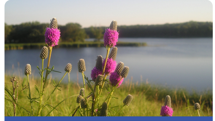
PURPLE PRAIRIE CLOVER (DALEA PURPUREA)